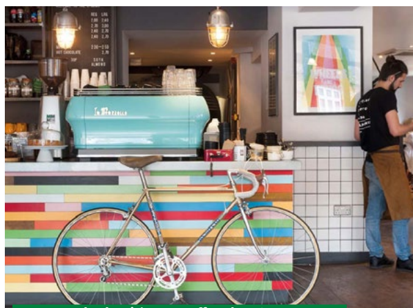
Dynamo also has it's own coffee shop & restaurant

Studies show that cycling schemes in the workplace reduce staff turnover