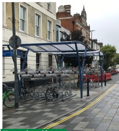
New cycle parking on Disraeli Road.

Or we could work with your employer to help them install one in your work place.